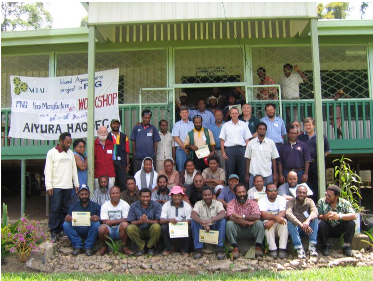
Workshop participants. See Appendix 10.2 for full list.

Each participant was presented with a workshop folder containing introductory material and printed versions of all power-point presentations. In addition each participant was given a CD containing PDF copies of all presentations, PDF copies of the National Research Council's Nutrient Requirements of Fish (NRC 1993) and an FAO publication titled The Nutrition & Feeding of Farmed Fish & Shrimp (Ed. Albert G.J. Tacon 1987). Participants were also provided with a hard-copy of a draft ACIAR publication titled Preparing Farm Made Fish Feed in Fiji & Papua New Guinea as well as literature on the nutritional requirements of poultry which was provided by Dr Phil Glatz. Miscellaneous folder items included an extensive list of potential feed ingredients for use in fish and poultry diets and a simple pro-forma for conducting small scale feeding experiments. In total, these resources provided each participant with an extensive amount of introductory level material on fish and poultry nutrition. All participants expressed a high level of satisfaction with the workshop materials and many commented on their usefulness during the workshop and acknowledged they would be an invaluable reference.